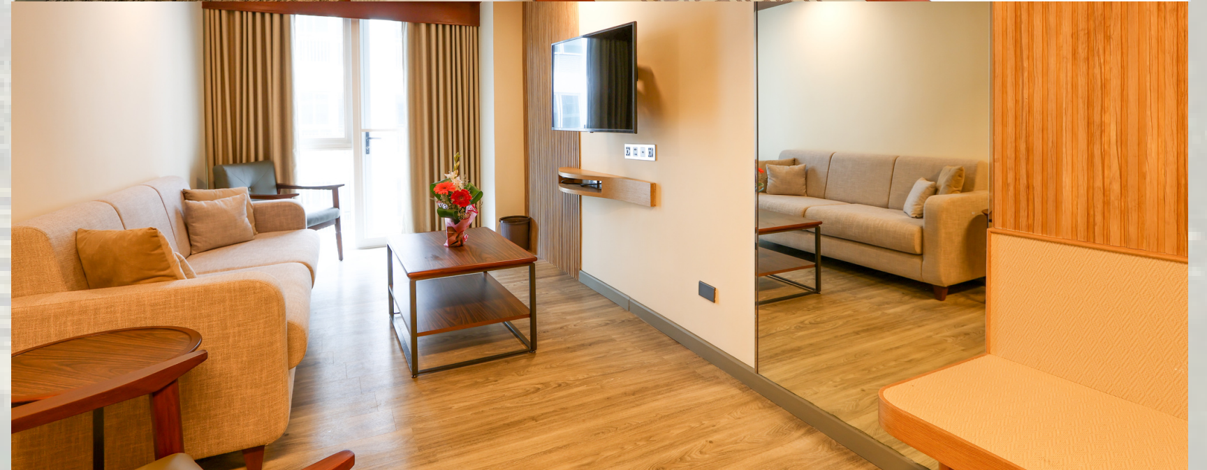
One Bedroom Suite